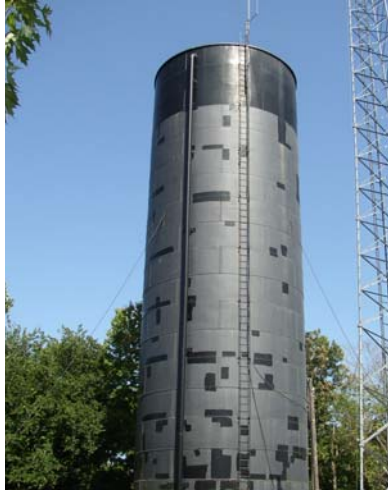
Plattsmouth Standpipe Constructed in 1887

The question has come up as to where the oldest water storage tank still in service in the state is located. I have looked through the sanitary survey forms used by state field representatives on all public water systems in the state, and there does not seem to be any place for the actual date the storage tank was built. Currently, the oldest water storage facility in the state known to me is